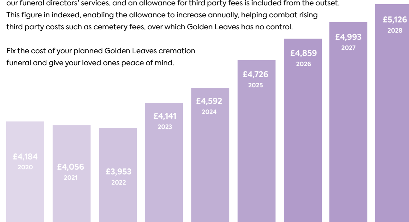
Funeral cost projected from 2020 until 2028

Fix the cost of your planned Golden Leaves cremation funeral and give your loved ones peace of mind.